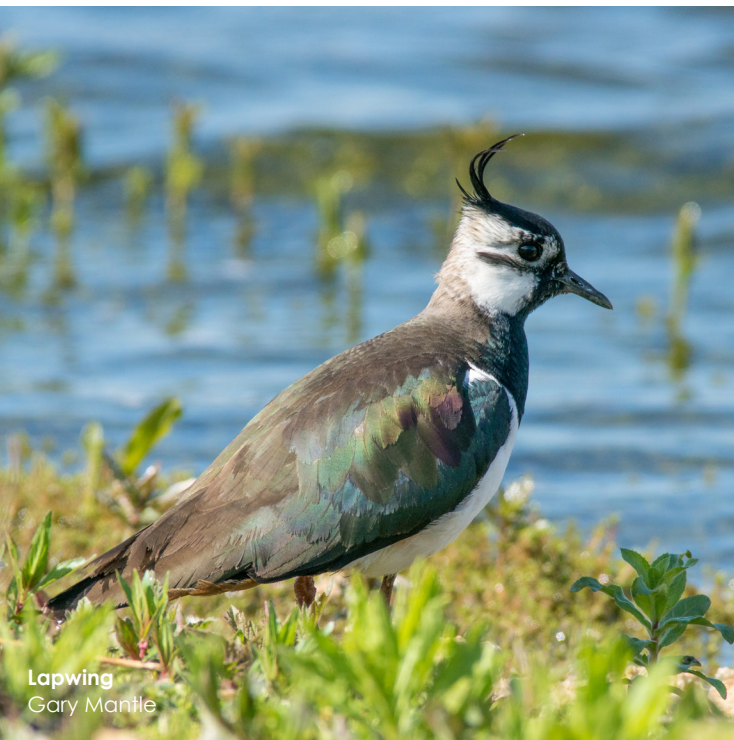
Lapwing Gary Mantle

From six hides overlooking the lakes, you can enjoy watching wildlife, from birds such as lapwings and kingfishers to 15 species of dragonfly and damselfly. Otters occasionally make an appearance, and you may spot a hobby, marsh harrier or even a white-tailed eagle soaring overhead on the hunt.