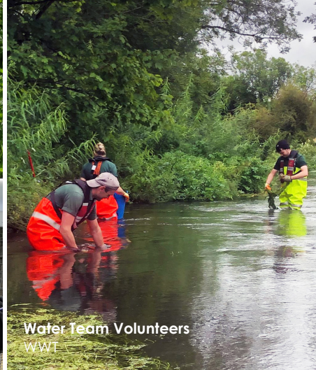
Water Team Volunteers WWT